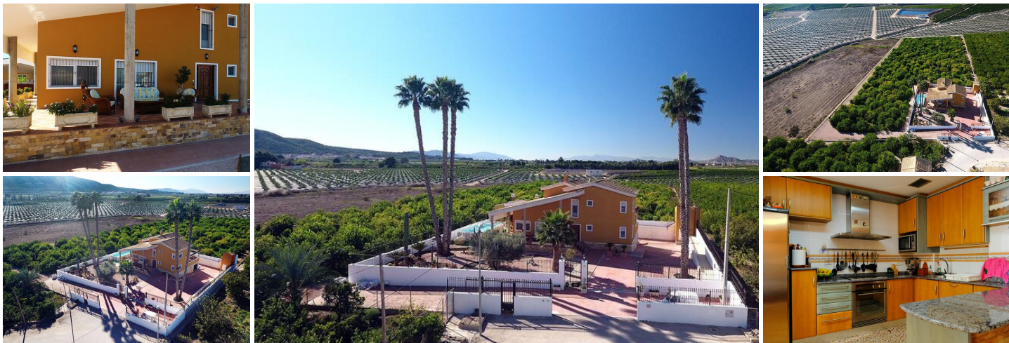
AMAZING COUNTRYSIDE FINCA WITH INCOME

9,480 m2. fully fenced property with 495 m2. house built on a plot of 1,000 m2. all fenced within the perimeter of the property.