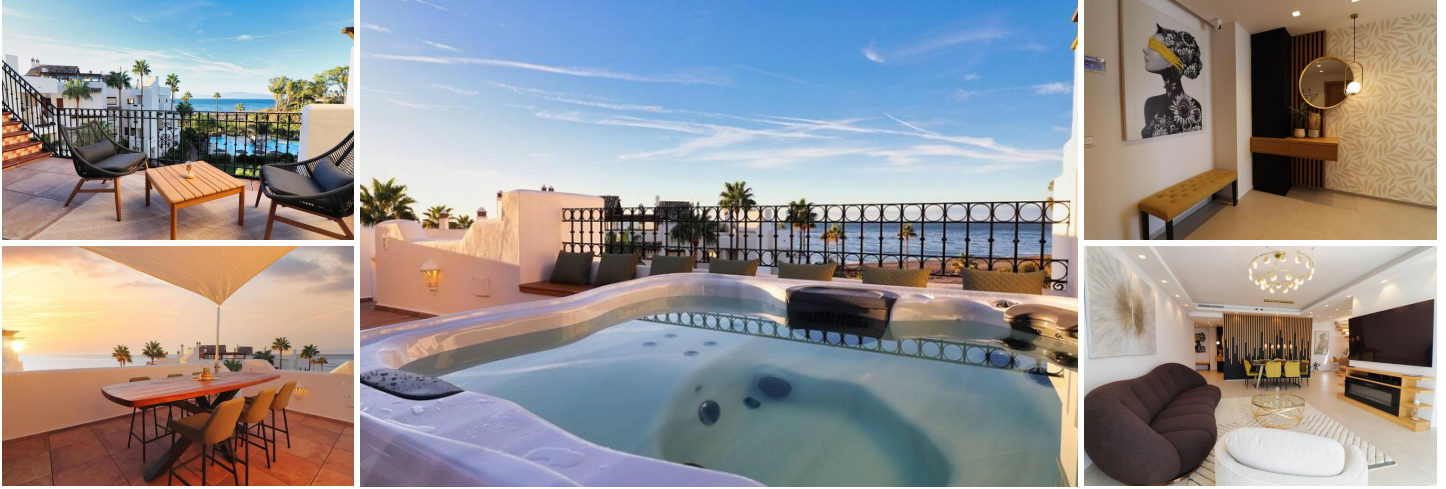
Luxury First-Line Penthouse in Estepona with Stunning Amenities