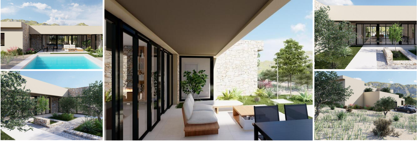
NEW BUILD VILLA IN YECLA, MURCIA

New Build exclusive luxury villa located within a beautiful vineyard in Yecla, Murcia