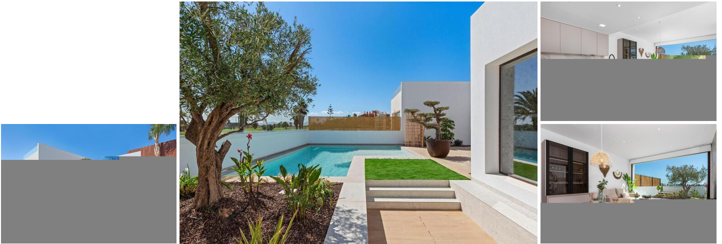
New Build Villas Front Line La Serena Golf in Los Alcázares

Discover a new residential complex in Los Alcázares, Murcia, featuring 16 modern apartments and penthouses with 2 or 3 bedrooms, alongside 8 exclusive villas. This development perfectly blends contemporary design, high quality, and functionality. Its unbeatable location offers stunning views of La Serena Golf and the Mar Menor.