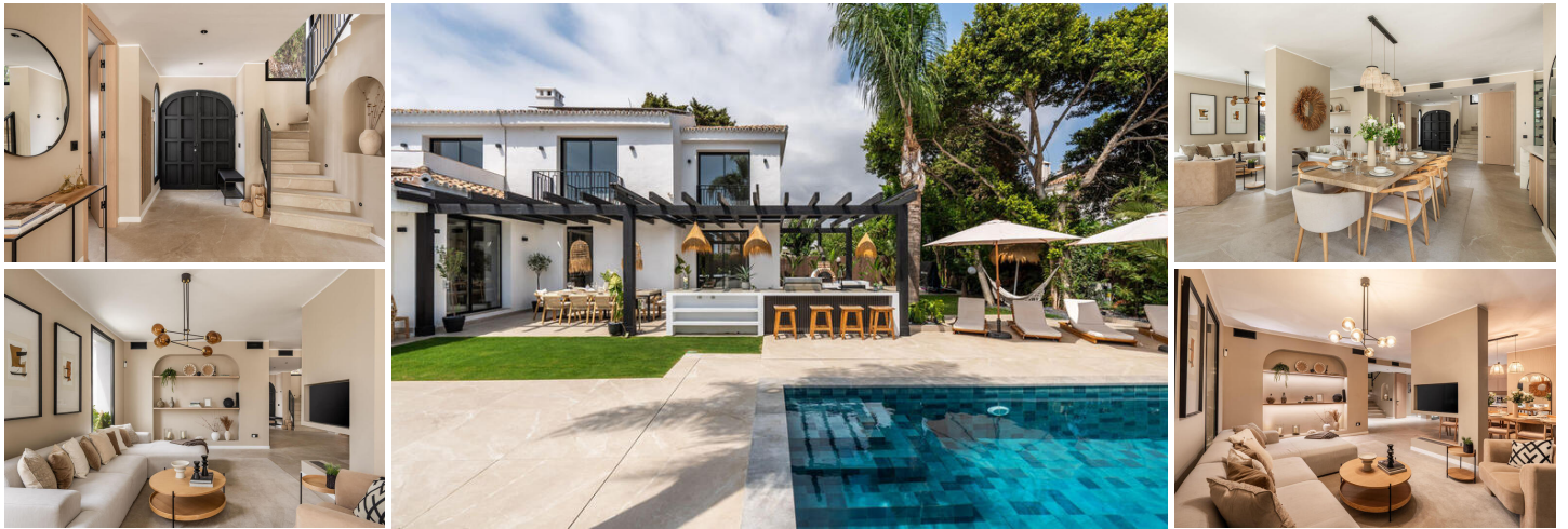
SAN PEDRO ALCANTARA ...IAS PETUNIAS 5 Bedroom, 4 Bathroom Villa

FREE Notary fees exclusively when you purchase a new property with MarBanús Estates