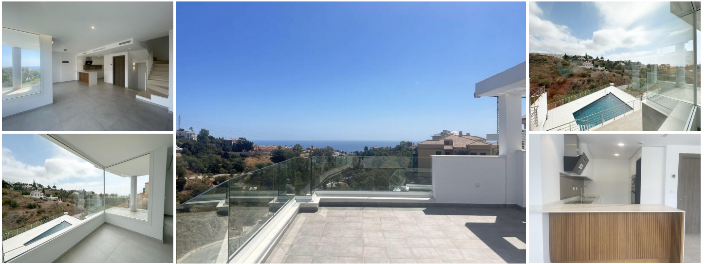
Semi-detached house - Sea and mountain views in Torreblanca

Great opportunity, 10 minutes from the beach! In a complex of 4 properties, we offer this charming semi-detached house that offers extraordinary views.