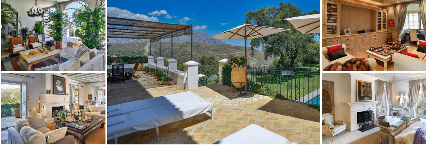
BENAHAVIS / EL MADROÑAL .... 5 Bedroom Villa

FREE Notary fees exclusively when you purchase a new property with MarBanús Estates