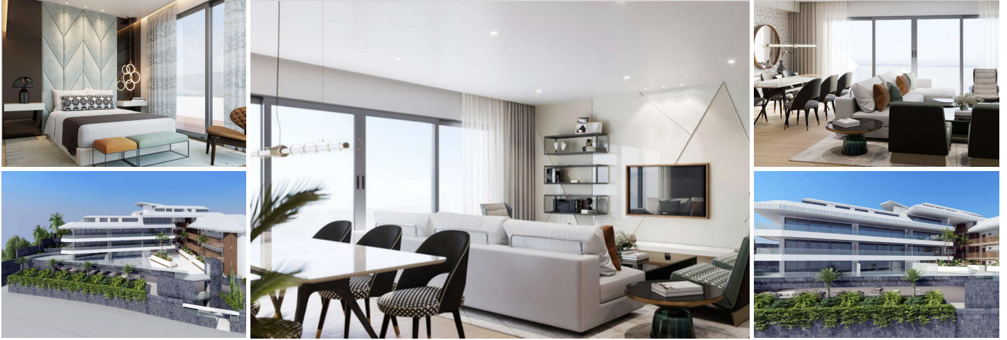
APARTMENT - TORREBLANCA

This apartment offers two bedrooms and has two bathrooms, one of which is connected to the master bedroom.