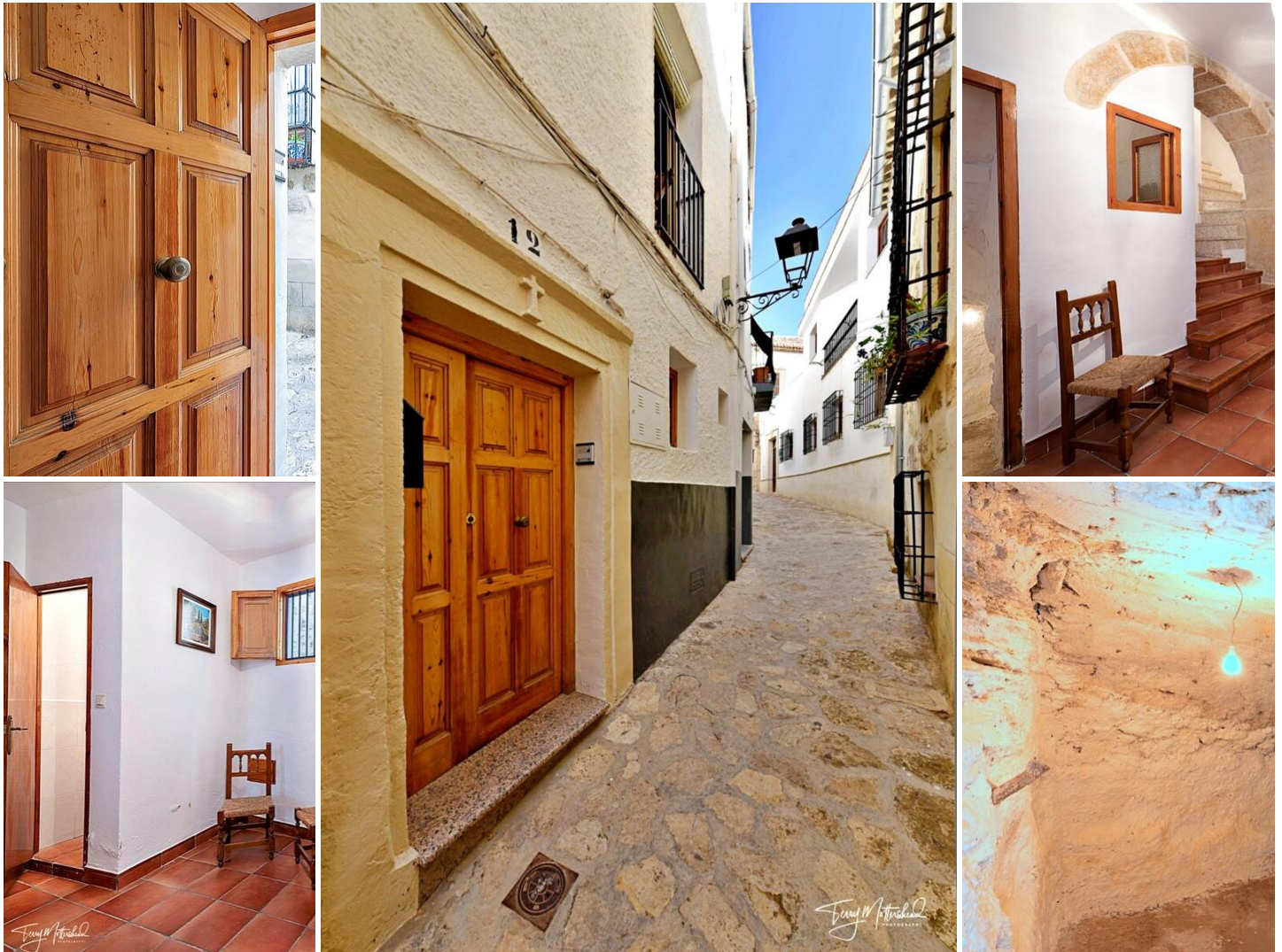
Historic two bedroom former convent cottage with wine cellar in the old quarter of Alhama de Granada.