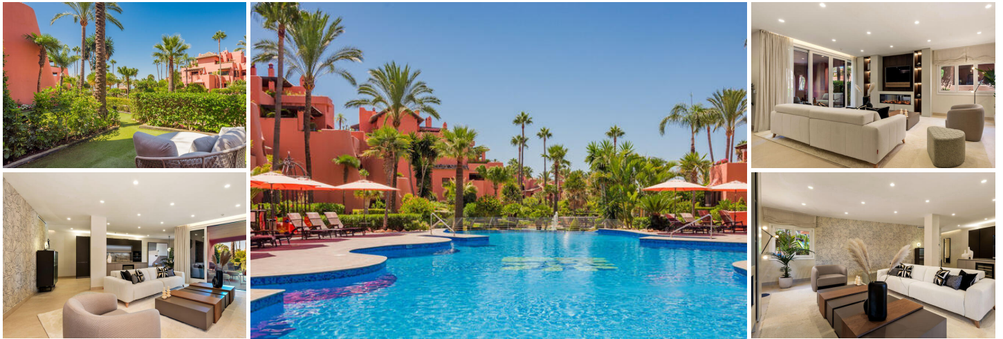
Ground floor apartment OCHER GREEN - First line beach urbanisation - Estepona

Fully renovated and refurbished top quality 3 bedrooms ground floor apartment in Torre Bermeja, less than 5 min drive to all amenities and 15 min drive to Puerto Banus, 10 min to Estepona. This front line beach urbanisation is gated with 24h security and offers two outdoor pools, two gyms, an indoor pool and two saunas.