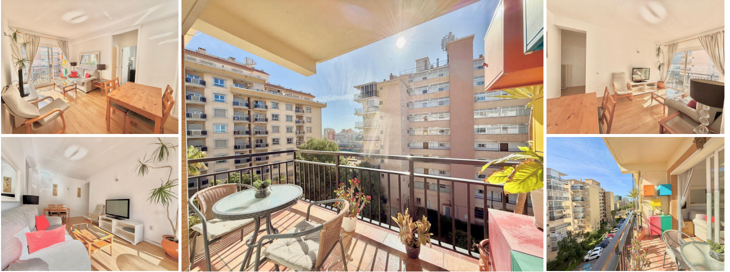
Bright 3-Bedroom Top-Floor Apartment in Los Boliches – Terrace with Open Views

Discover this fantastic top-floor apartment located in one of the most sought-after areas of Fuengirola: Los Boliches. This property boasts a spacious south-facing terrace, offering plenty of natural light throughout the day and open views that provide a peaceful and sunny atmosphere.