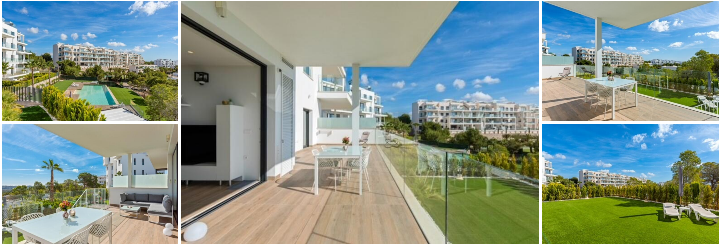
Luxury ground floor apartment in Las Colinas, Campoamor, Alicante, Costa Blanca South

Discover your dream investment in the stunning Costa Blanca with this spacious and beautifully designed two-bedroom apartment, completed in February 2022