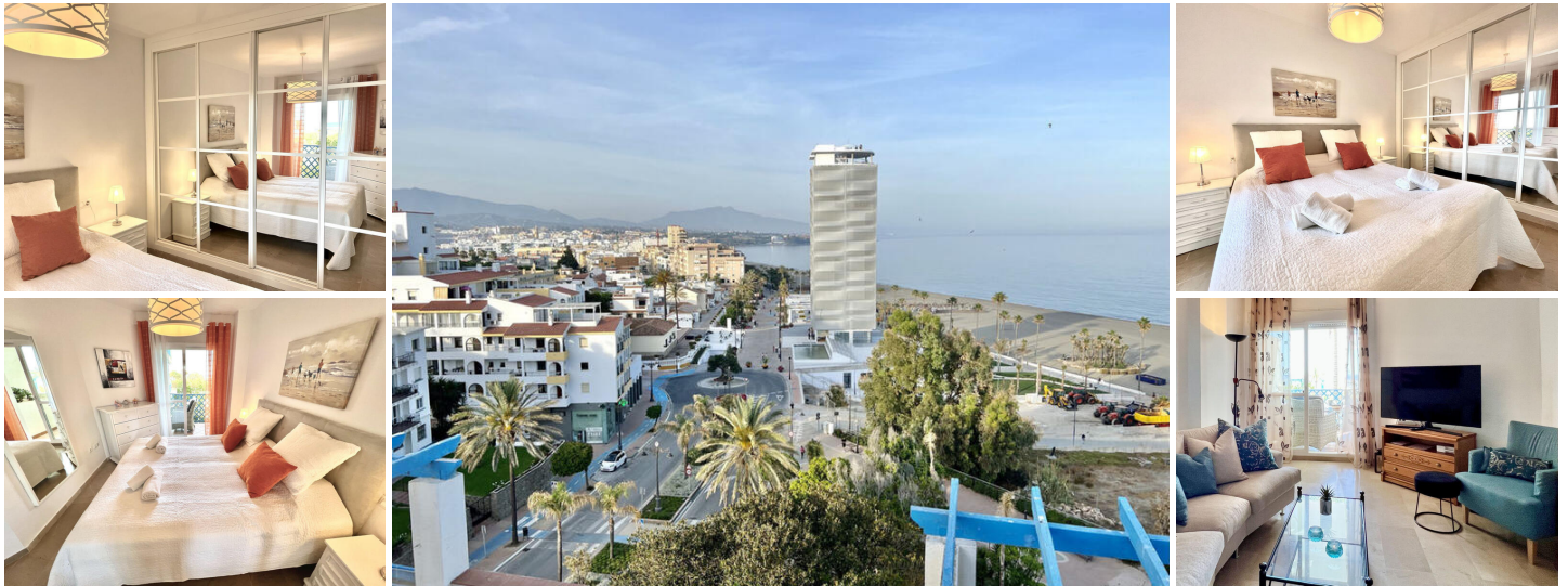
Sea View Apartment for Sale in Estepona Port – Fully Furnished, Prime Location, Excellent Investment

We're proud to present this beautifully located apartment for sale in Estepona, just steps away from the popular Estepona Marina and only a few minutes' walk from the vibrant town center, beaches, shops, and restaurants.