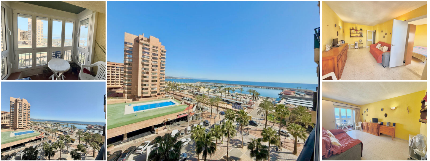
First-Line Beach Apartment with Lateral Sea Views and Views of Fuengirola's Marina

This beautiful apartment is located in a prime position, right on the first line of the beach, offering lateral sea views and stunning views of the Fuengirola Marina, providing an unbeatable setting to enjoy the coastal lifestyle.