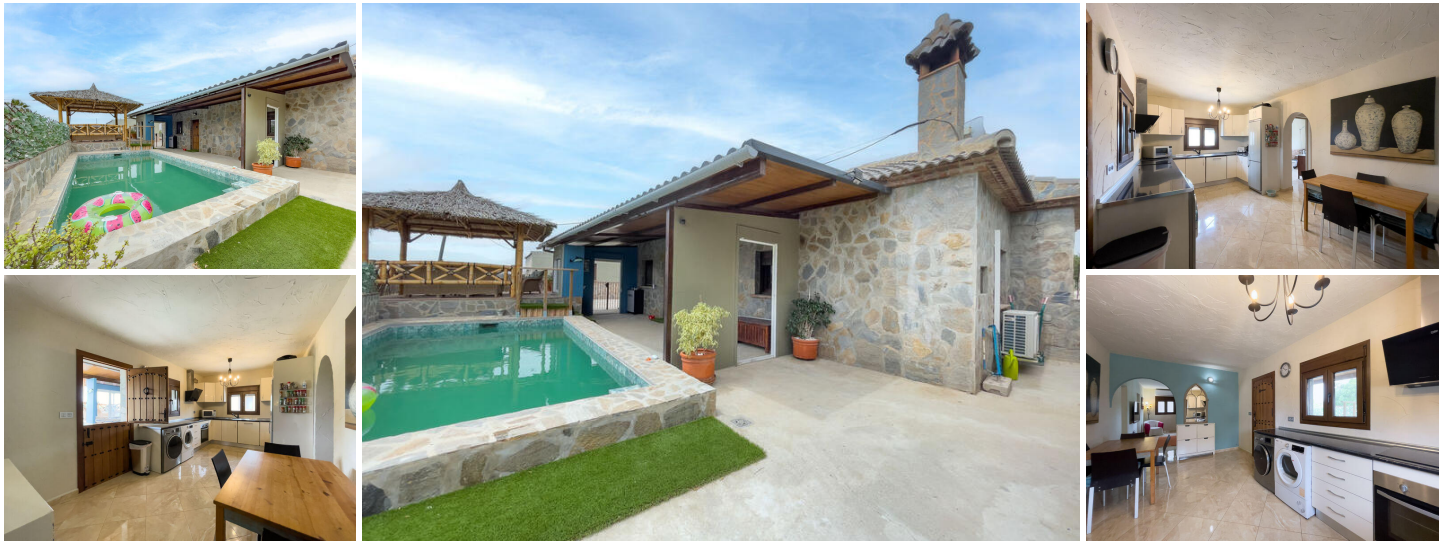
Stunning 3-Bedroom House in Coín with Pool and Expansive Land