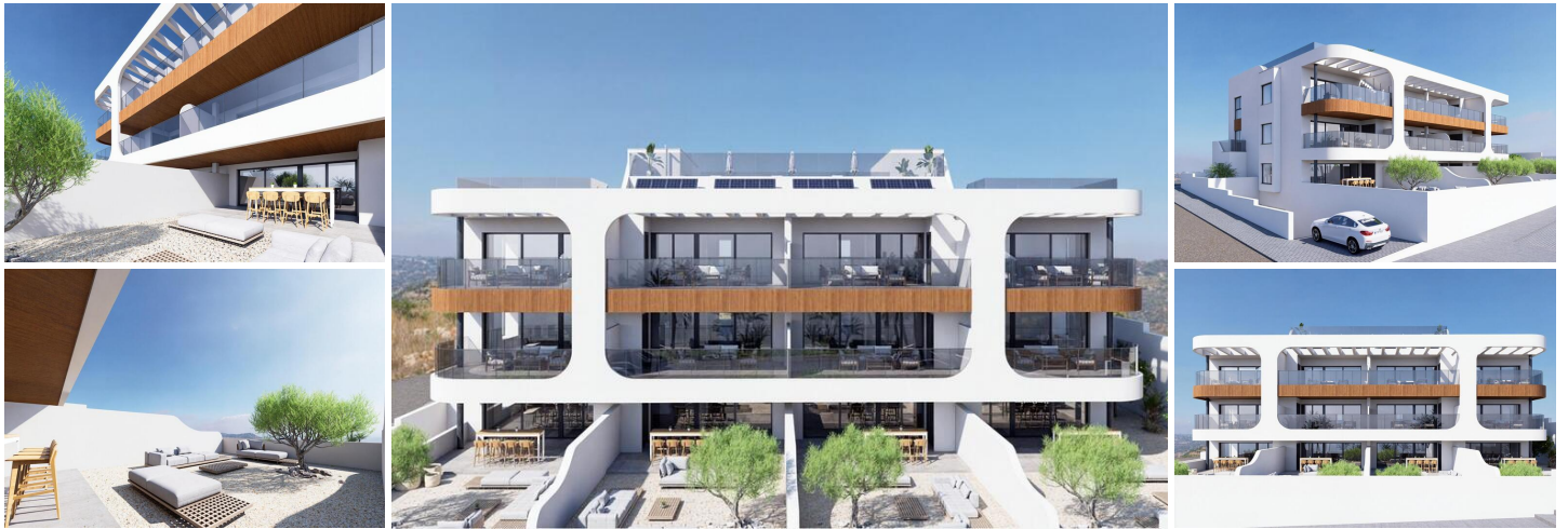
New Build Apartments in Benijófar - Design, Comfort and Privileged Location