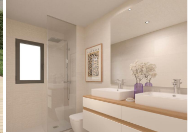
Luxury Residential Complex in Torremolinos: A Mediterranean Masterpiece