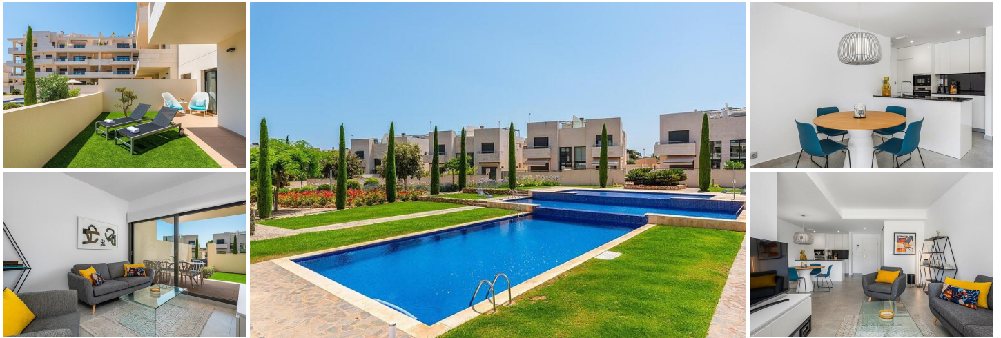
South facing ground floor apartment in Los Dolses, Orihuela Costa

This modern ground floor apartment, located in the highly sought-after area Los Dolses in Orihuela Costa, offers everything you need for a luxurious and comfortable lifestyle in sunny Spain. The apartment features 2 spacious bedrooms, 2 contemporary bathrooms, and a terrace of no less than 60 m 2 , perfect for enjoying outdoor living, relaxing, or dining al fresco. Facing southwest, the apartment benefits from plenty of natural light and stunning sunsets.