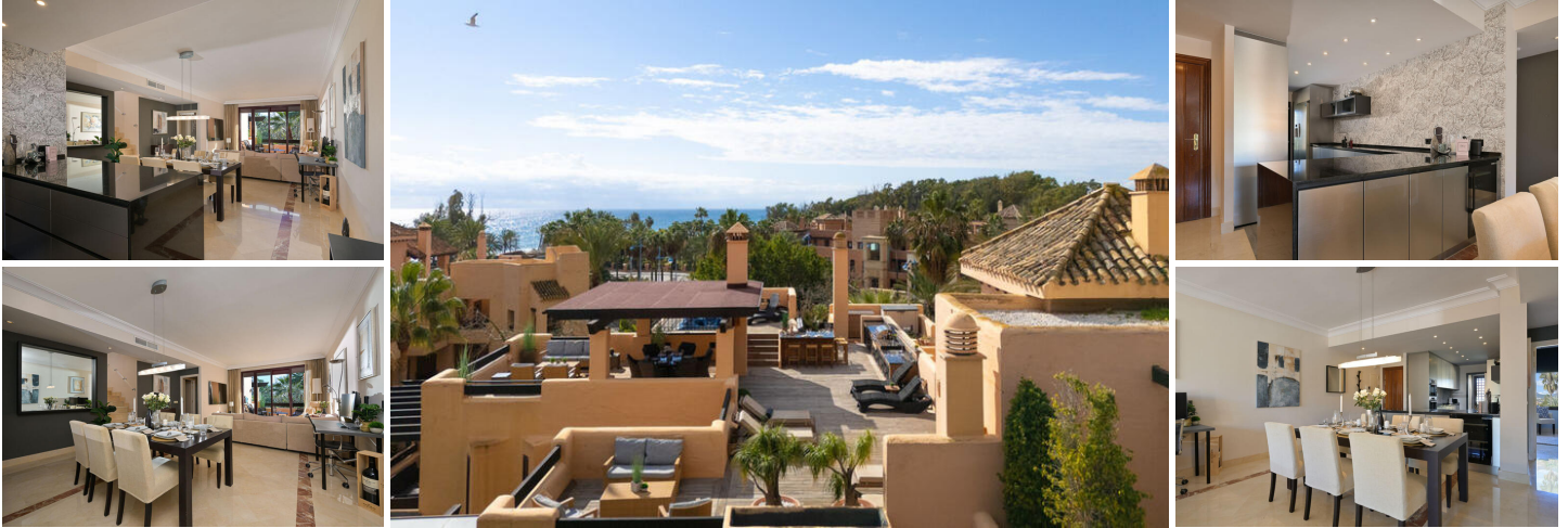
Luxury Penthouse – San Pedro Alcántara – First Line New Golden Mile

Don't miss the opportunity to visit and fall in love with this spectacular home!