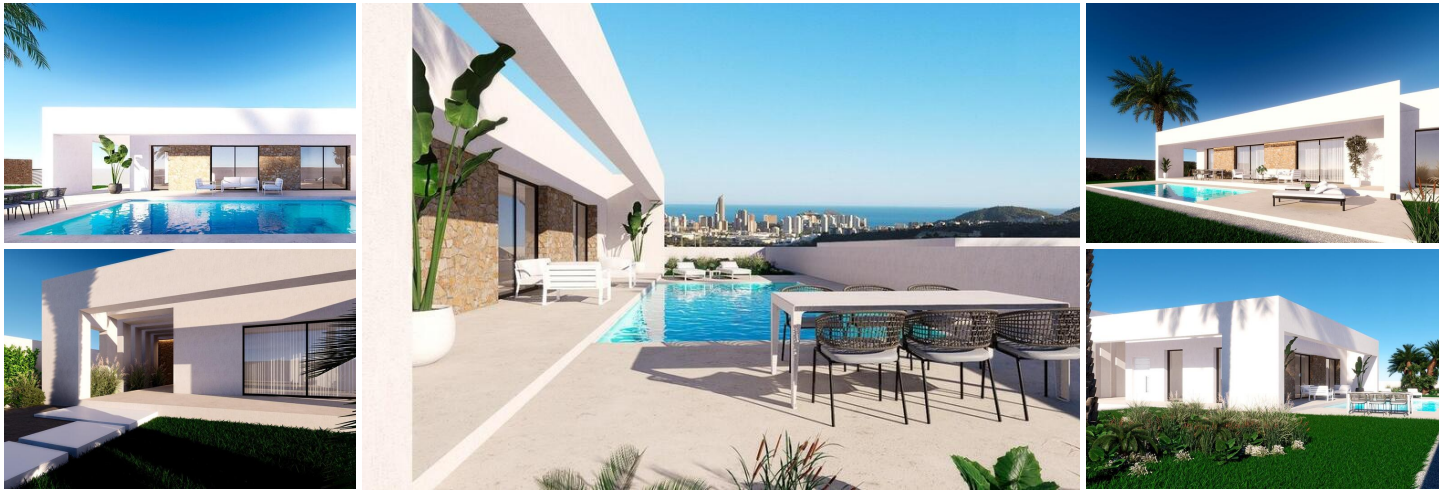
Newly built villas with sea views in Finestrat-Benidorm

Exclusive residential complex with views of the sea and the city of Benidorm