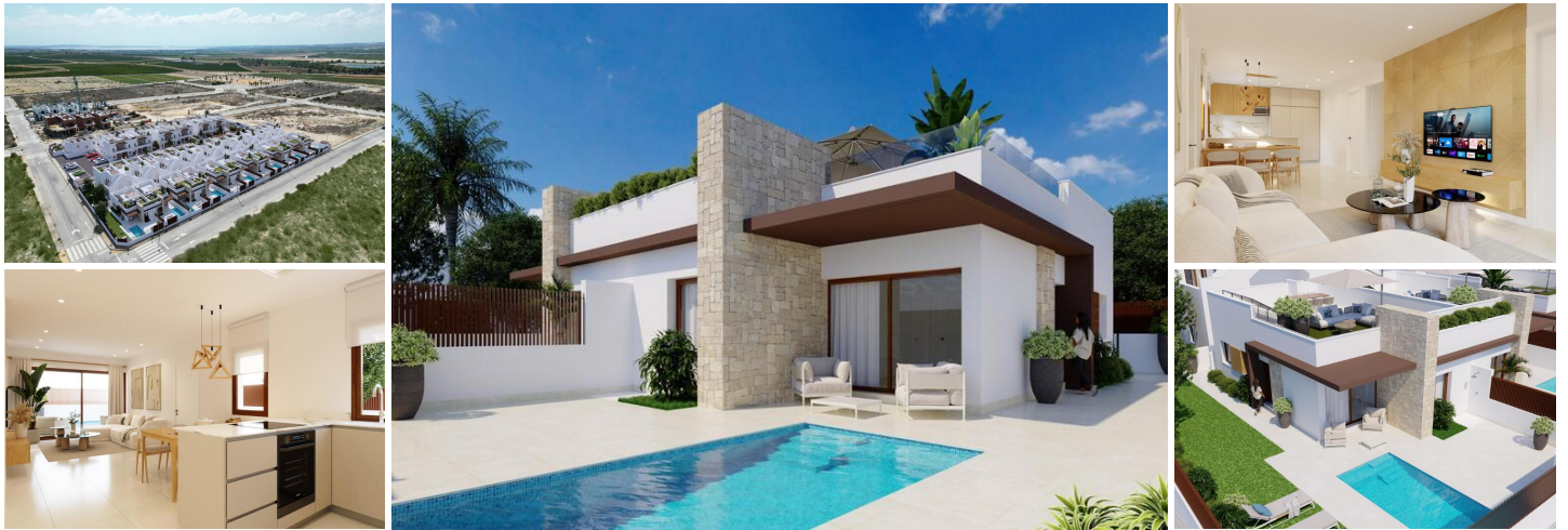
New Build Homes in Vistabella Golf Resort, Orihuela