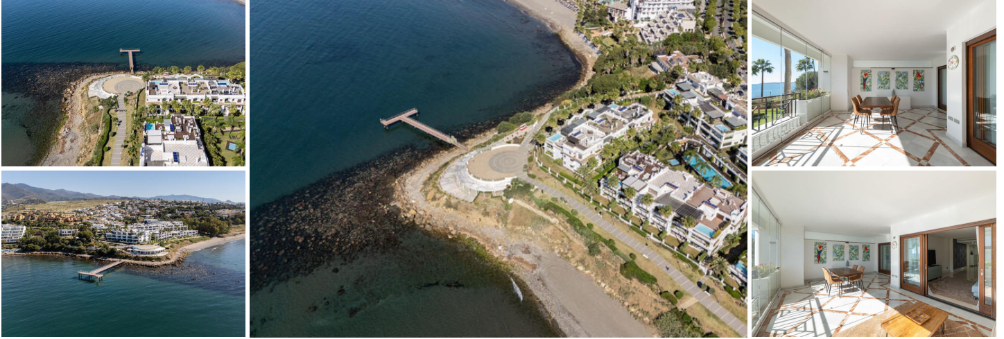
Modern Apartment with Panoramic Views in the DONCELLA BEACH Complex

A spacious apartment in the prestigious DONCELLA BEACH complex, located on the second floor. Recently renovated, it features a modern design, high-quality materials, and exceptional comfort. The apartment is fully furnished, and the kitchen is equipped with high-end appliances.