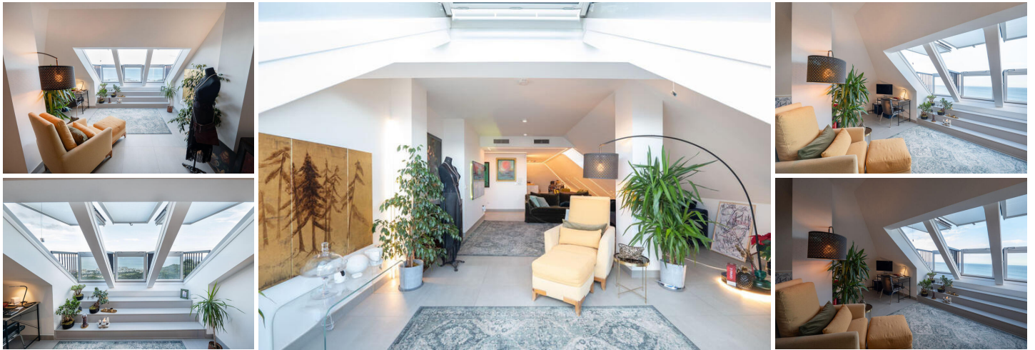
Luxurious Penthouse in La Duquesa

This stunning penthouse perfectly combines modern design, functionality, and elegance.