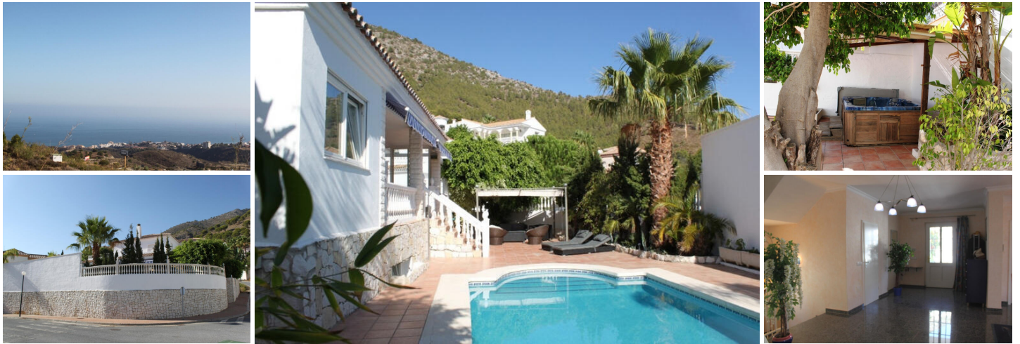
CONTEMPORARY VILLA WITH PANORAMIC SEA VIEWS - MIJAS AREA - PRICED TO SELL

Located in the Mijas Pueblo area, in a gated, secured and famous urbanization, situated just a few minutes from the village, and only 10 minutes from the beach and 15 minutes to the Málaga international airport, this contemporary villa built over three floors, would be the perfect investment for those looking for a large property with major features and a very low maintenance.