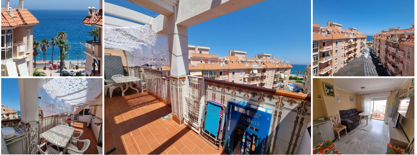
Beachside 2-bed penthouse with terrace and sea views.

The living room is large and bright with direct access to the terrace with sea views. The terrace area is large enough to fit a dining table comfortably in one side and still have plenty of terrace area.