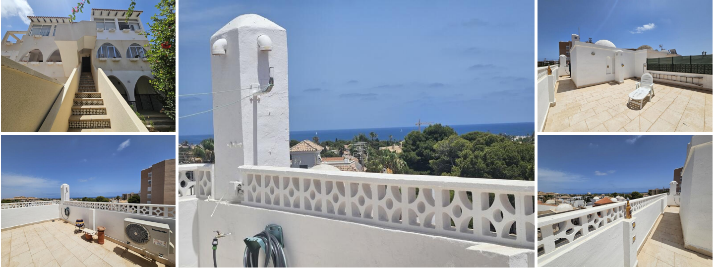
LA ZENIA BEACH SIDE WITH SEA VIEWS.

Incredible investment opportunity to purchase this 3 bedroom, 2 bathroom duplex penthouse apartment with wonderful sea views of the Mediterranean. Located beachside of La Zenia this property is less than 700m from the beach and a 5 minute walk from the famous Paddy's Point and Brown's cocktail bar. The duplex apartment is built across 2 levels with the lower level comprising of an open plan lounge and dining room with an American style fully fitted kitchen, a family bathroom and 2 double bedrooms. There is also a very sunny glazed terrace providing an extra dining area. Upstairs is a spacious third bedroom and access to the spectacular solarium with impressive sea views.