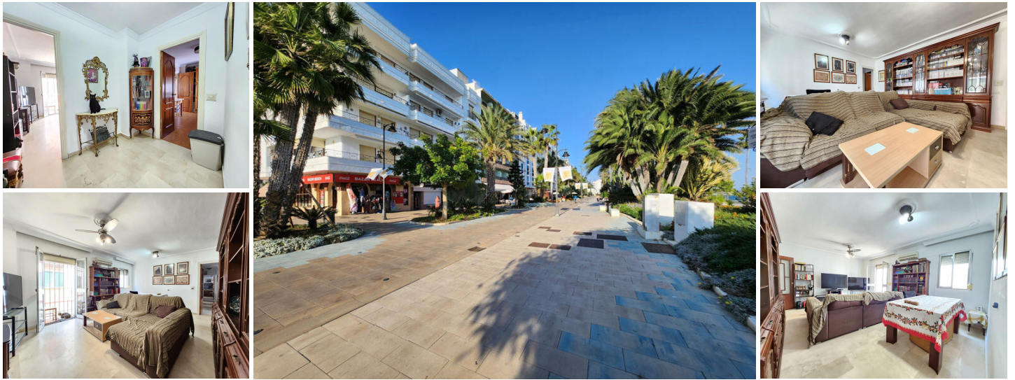
Apartment for Sale in Estepona

This cozy 90 m 2 apartment, located in a prime area of Estepona, is an excellent opportunity for those seeking comfort and functionality in a vibrant and growing neighborhood.