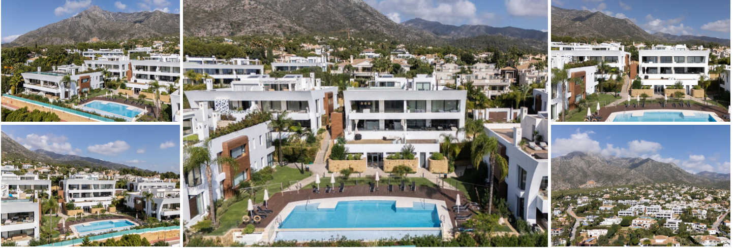
Elegant Two-Level Penthouse with Panoramic Views in La_Reserva

La_Reserva_a is an exclusive and secure luxury community located in one of Marbella's most prestigious areas. The complex is surrounded by beautifully maintained gardens and offers a wide range of amenities for comfortable living and relaxation. With high-level security, privacy, and breathtaking views of the Mediterranean Sea, La Concha mountain, and the coastline, this is the ideal place for those who value seclusion and elegance.