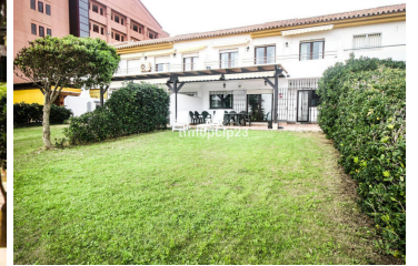
LA DUQUESA MANILVA BEACH SIDE TOWNHOUSE FRONT SEE VIEWS

This light and airy townhouse is located right on the beach in this lovely gated community just a short distance to the lovely Port of La Duquesa and only 30 minutes drive to Gibraltar Airport. There are 4/5 bedrooms, a communal pool, children's pool, tennis courts, has parking for 2 cars and can accommodate up to 8 people. The property is completely equipped and has hot and cold air conditioning. Another added benefit is that there are 2 terraces and a fenced communal garden from which to enjoy the sun.