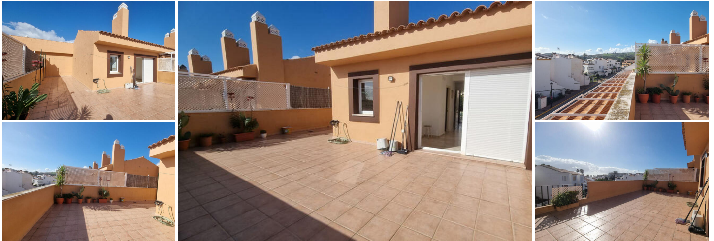
Fantastic Penthouse with Sea Views in Casares Costa

If you dream of living by the sea, this spectacular penthouse is the perfect opportunity. Located just a few steps from the beach and promenade, and a short walk from the charming town of San Luis de Sabinillas, this apartment has everything you need to enjoy the Costa del Sol to the fullest.