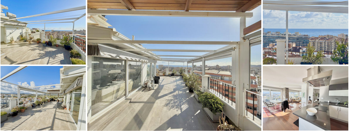
"Luxury Penthouse in Fuengirola, Costa del Sol

Discover this stunning penthouse located in the heart of Fuengirola, one of the most sought-after towns on the Costa del Sol. Featuring 3 spacious bedrooms and 2 bathrooms, this property combines comfort, luxury, and a prime location, making it an exceptional opportunity.