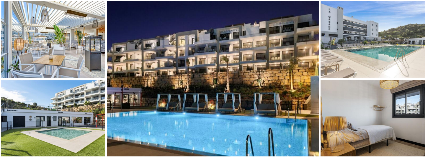
Luxurious 3-Bedroom Apartment in Hacienda del Sueño

Discover your dream home in the heart of the Costa del Sol at Hacienda del Sueño, a premier residential complex nestled between Málaga and Marbella.