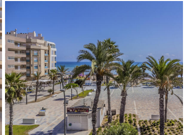
Luxury Apartment in La Mata

Discover this exclusive apartment with breathtaking sea views in the prestigious La Mata Plaza development.