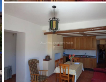
Cortijo Caparros - A country house in the Oria area. (Habitable)

Semi-detached 4+ bedroom cortijo for sale in Almeria Province, situated in the popular Rambla de Oria area. The property has been part renovated and is completely habitable, although further renovation is required to maximise the potential of this large family home.