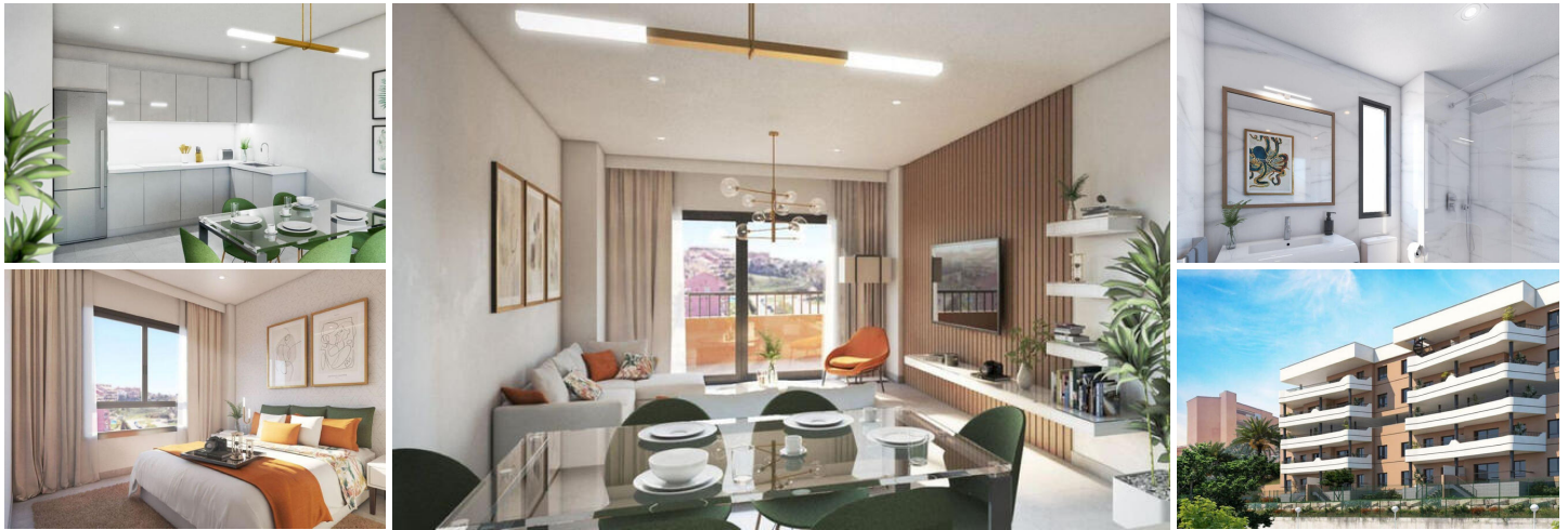
Sunhill new Phase

Sunhill is located in a residential area with endless possibilities, located just 2 kilometres from the sea and a 5 minute walk to the centre of Los Pacos, Fuengirola.