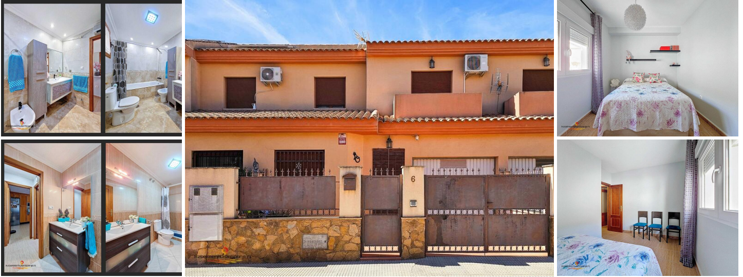
Townhouse with Garage and Basement in Pinoso

Living in the charming town of Pinoso, where all amenities, such as shops, restaurants, schools, sports facilities, and medical services, are within walking distance? This spacious townhouse is situated on a quiet street with ample parking and even features its own garage. At the front of the house, there is a large, tiled terrace, while a cozy patio awaits at the rear. Additionally, one of the upstairs bedrooms has a balcony, allowing you to fully enjoy the Spanish outdoor lifestyle.