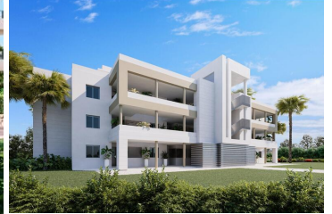
NEW BUILD RESIDENTIAL COMPLEX IN LAS LAGUNAS DE MIJAS

New Build residential complex in Mijas Costa, Malaga.