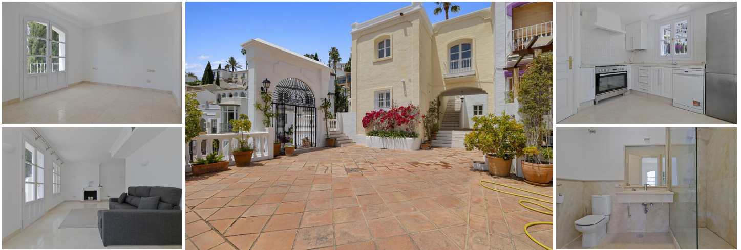
BENAHAVIS ... TOWNHOUSE

FREE Notary fees exclusively when you purchase a new property with MarBanus Estates