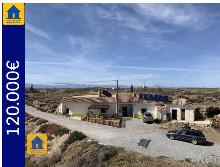
Cueva Ahimsa in Caniles

This is a detached 4/5 bedroom rustic cave house situated on 10,000m 2 of land. This beautiful cave property is located on its own in the hills of the Altiplano de Granada. The location feels remote however it is just 10 minutes drive to the village of Caniles and 15 minutes to the city Baza.