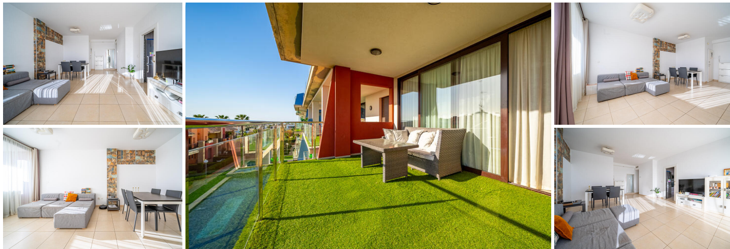
3-bedroom apartment in Lomas de Cabo Roig with sea views

Second-floor apartment in a private residential complex with 3 bedrooms and 2 bathrooms. The property offers a spacious living-dining room, separate kitchen, and a large terrace with artificial grass and a sofa overlooking the communal areas.