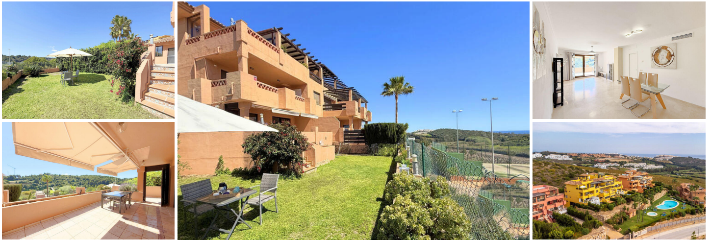
Exclusive Apartment with Private Garden, Sea Views, and Independent Apartment, Casares Costa

This magnificent ground-floor apartment stands out for its spacious private garden and excellent southwest orientation, ensuring exceptional brightness throughout the day and breathtaking sunsets. Located in a privileged setting on the frontline of a golf course, it offers stunning views of the mountains and the sea. It is situated in Casares Costa, within the exclusive Doña Julia Golf area, a rapidly developing zone featuring luxury developments and a Hilton hotel under construction.