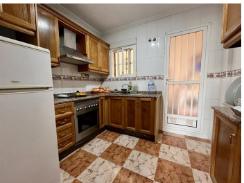
This is your chance to own a beautiful 2-bedroom, 1-bathroom ground-floor apartment perfectly situated in Villamartin, just a short walk from bars, restaurants, shops, and all essential amenities.

The property features built-in wardrobes in both bedrooms, a bright and airy living space, and a well-equipped kitchen. Step outside to a private garden, perfect for soaking up the sun and enjoying outdoor dining. As part of a well-maintained community, you'll also have access to a stunning communal swimming pool.