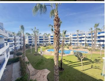
This impressive 2 Bedrooms, 2 Bathrooms Penthouse Apartment is located in the popular urbanisation of La Calma in Playa Flamenca.

The property over looks the beautiful communal pool and gardens and situated within a gated complex with elevator access to the apartment, as well as secure parking space while being within a stones throw of all local amenities.