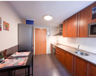
Apartment in Casares Golf Garden.

This modern 2-bedroom, 2-bathroom apartment is located in the prestigious Casares Golf Garden development, just a few kilometers from the coast. The apartment features a spacious and bright living room with a closed kitchen, perfect for cozy evenings. From the living room, you have access to a covered terrace that overlooks a private garden, ideal for enjoying the outdoor lifestyle.