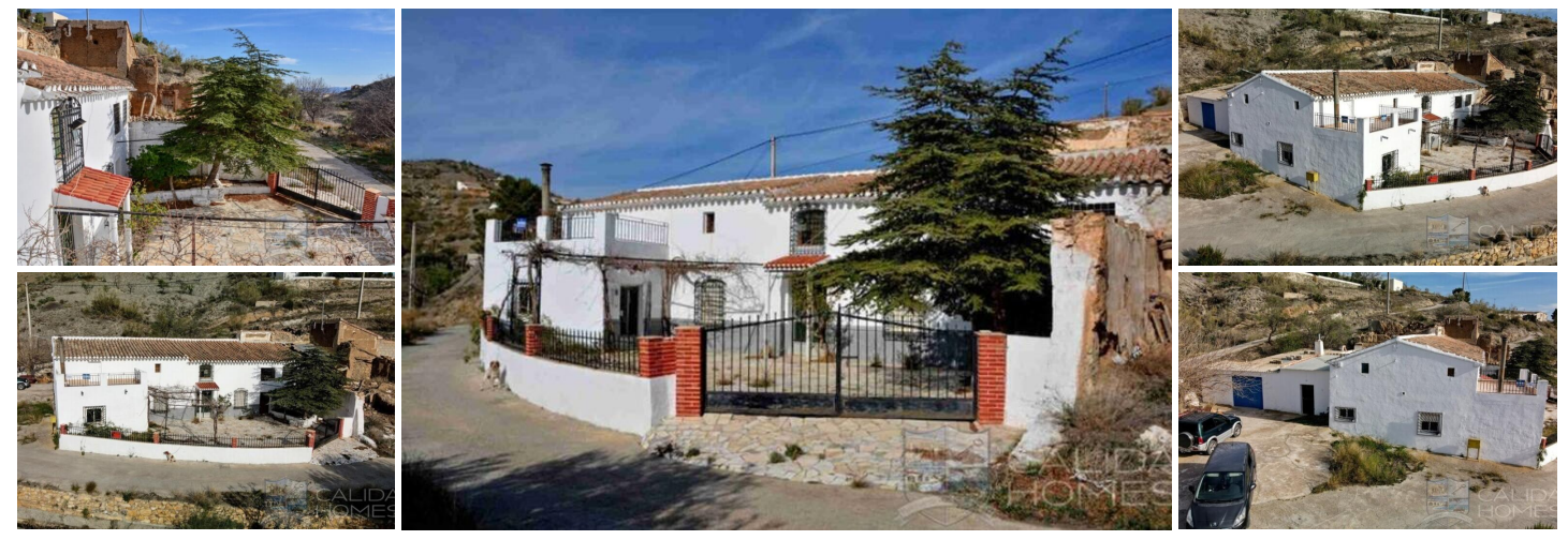
Casa Traditional - A Fantastic Bargain Country Home with Endless Potential

Located in the tranquil rural hamlet of Las Pocicas, Albox, Casa Traditional offers an exceptional opportunity to own a large 8-bedroom, 2-bathroom countryside home with a separate adjoining ruin for reform. This fully habitable former farmhouse boasts 359m<sup>2</sup> of living space across two levels, an integral garage, multiple reception rooms, and a large roof terrace with breathtaking views. The property sits on 1,000m<sup>2</sup> of land, providing plenty of space for outdoor living.