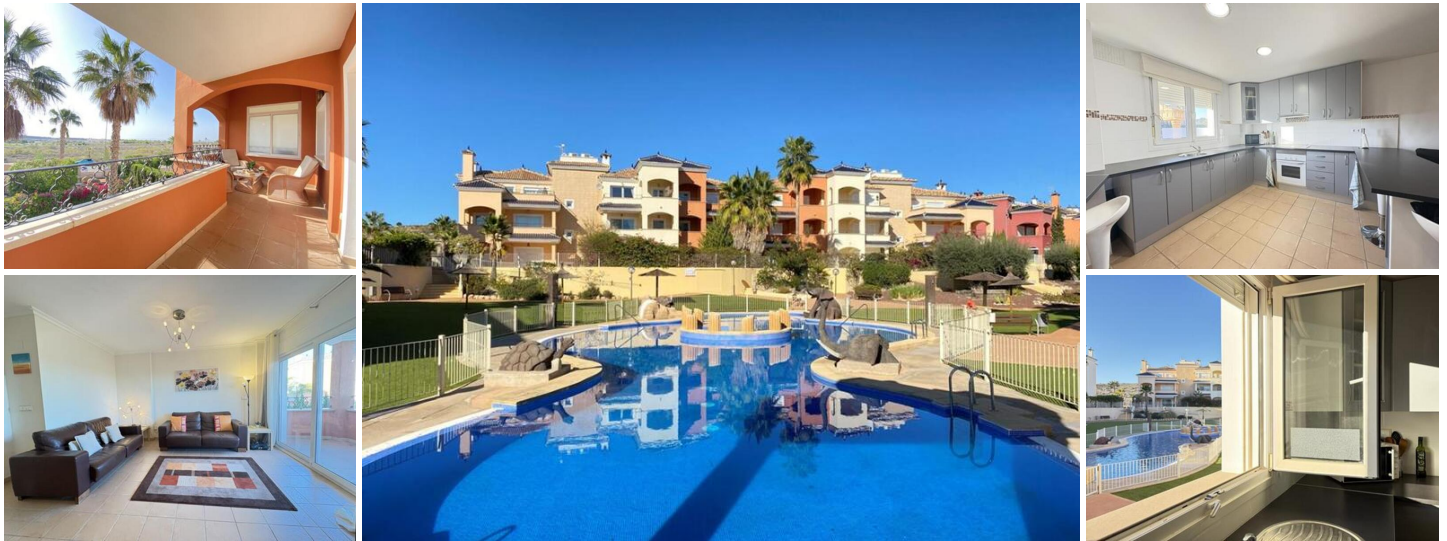
Stunning 2-Bedroom Duplex Apartment in Altaona Golf & Country Village

This is a truly unique property—a duplex apartment unlike any other, offering an impressive 185 square meters of bright, spacious living space, a private terrace, and a spectacular solarium. Located in the exclusive Altaona Golf & Country Village, this apartment is a rare gem.