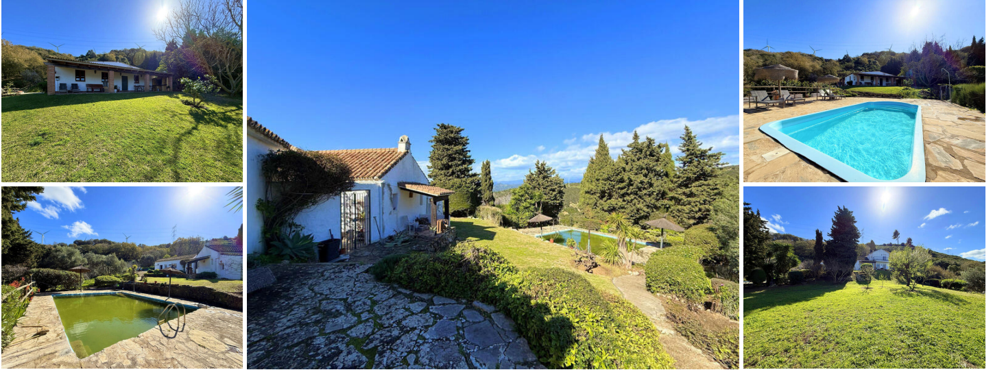
Charming villa in Casares Costa.

Located in a privileged setting, just a 12-minute drive from the stunning Costa del Sol. Situated 8 km from the picturesque white village of Casares. Towns such as Estepona and the Port of La Duquesa are both just 15 minutes away by car, offering beautiful sandy beaches along with a wonderful seafront promenade lined with a variety of restaurants, beach bars, and entertainment areas.