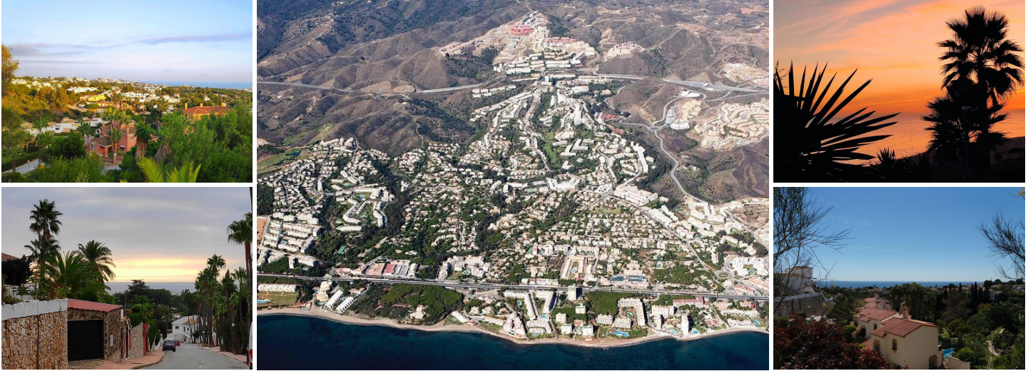
Urban Plot in Calahonda