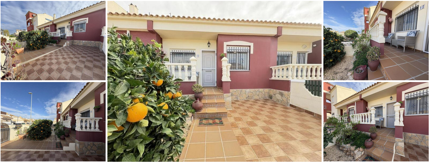
Charming One-Story Townhouse with Solarium in Sucina

This lovely two-bedroom, one-bathroom townhouse is the perfect home for those seeking comfort and tranquility. The property is all on one level and features a spacious 35m 2 front porch, ideal for relaxing or enjoying outdoor dining.