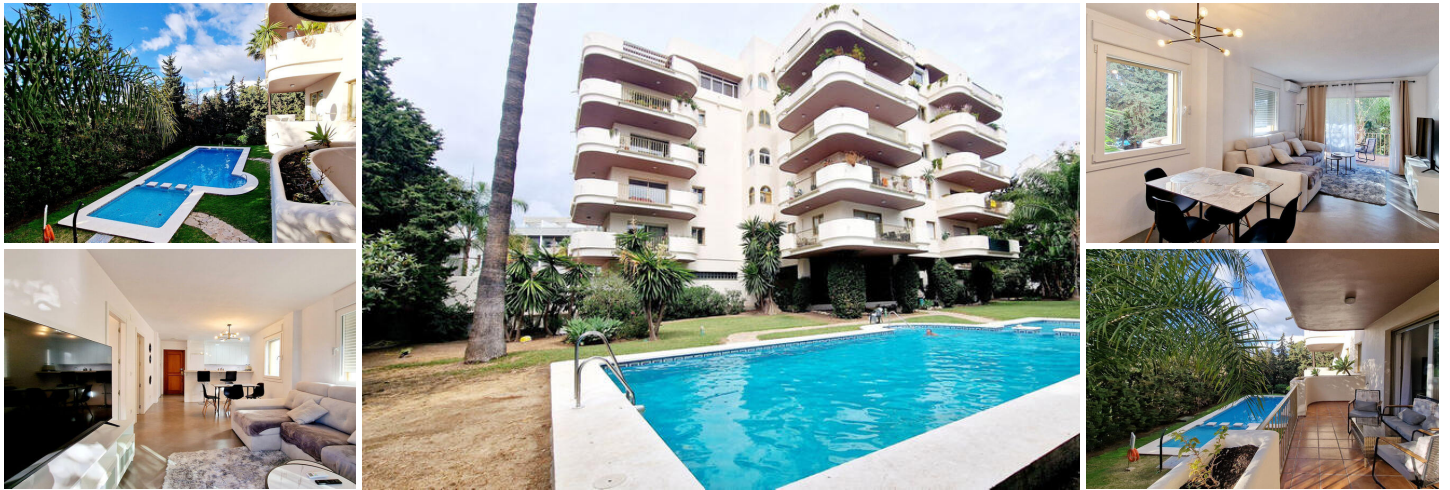
Marbella, Nueva Andalucia... Luxurious Corner Apartment Next to Hard Rock Hotel & Puerto Banus

Discover this meticulously renovated corner apartment, Every detail has been crafted with the finest and most noble materials, ensuring a luxurious living experience. This stunning apartment features 2 bedrooms, each styled like a 5-star hotel suite, and an elegant bathroom. The spacious terrace offers a perfect spot for relaxation. This property is truly exceptional, don't miss out on this unique opportunity to own a piece of Marbella's luxury living next to Hard Rock & Puerto Banus.